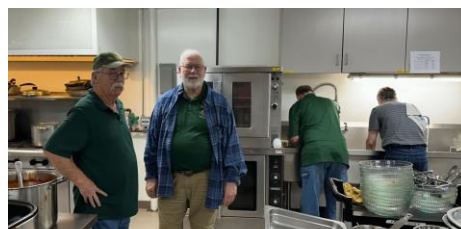
Part of the Volunteer Crew for the Spaghetti Dinner