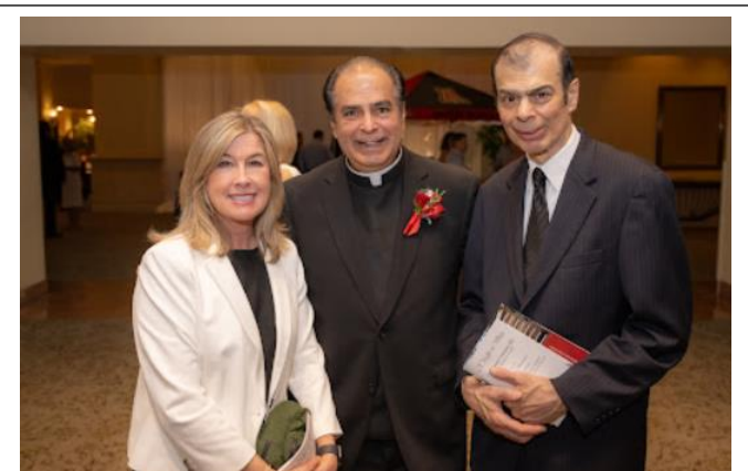
Assorted pictures from the crowd at the gala.