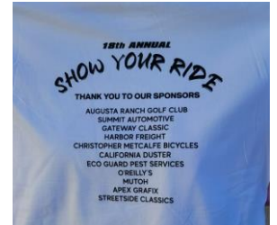
Commemorative Car Show T-Shirt