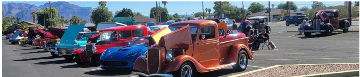
Some of the Cars on Display