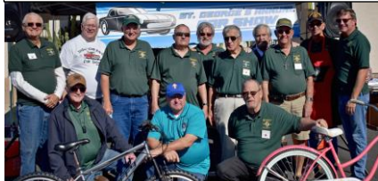
Volunteers Who Made It Happen