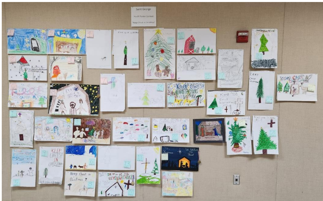
Keep Christ in Christmas Posters on Display in Social Hall