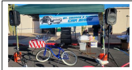
Raffle Central & Registration Desk