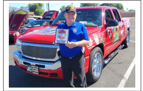
Grand Knight's Award