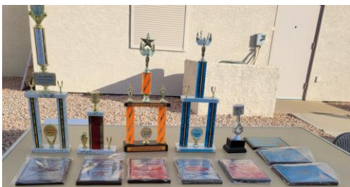
Awards presented to winners of various categories.