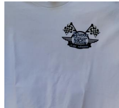
Commemorative Car Show T-Shirt