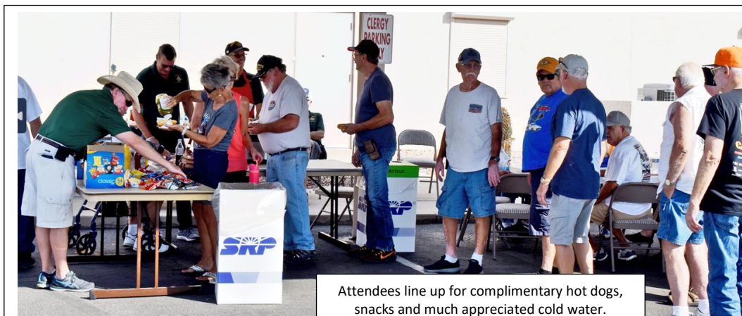
Attendees line up for complimentary hot dogs, snacks and much appreciated cold water.